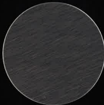
Clear Coated Stainless Steel