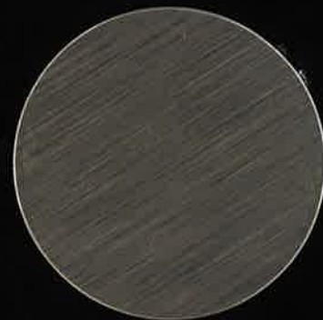
Satin Nickel Steel