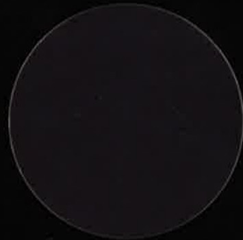
Tinted Stainless Steel "Black Smoke"